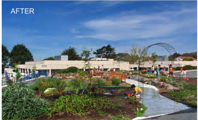
The transition from a traditional, paved schoolyard to a living schoolyard can be dramatic and opens up a variety of opportunities for children to learn, play and explore.